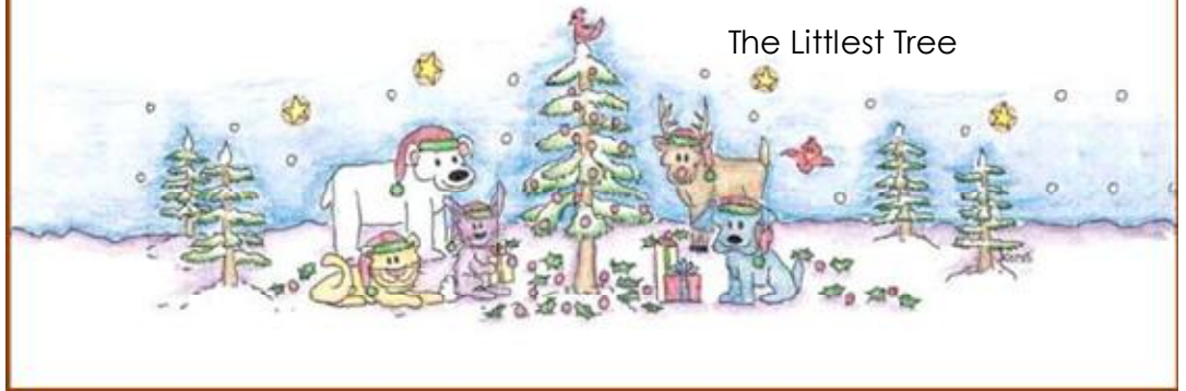
The Littlest Tree

I have now returned home and am enjoying time with my brothers and sisters here in the forest. My visit to Providence during the Christmas Season was a total joy once again! My branches were filled and my roots covered with lovely hats, mittens, children's underwear and oh how they will be enjoyed. Once again, I enjoyed my visit and surely hope to be invited to return during the Christmas Season in 2012.